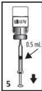
Figure 5 After reconstitution, immediately withdraw 0.5 mL of Pentacel vaccine and administer intramuscularly. Pentacel vaccine should be used immediately after reconstitution.

In infants younger than 1 year, the anterolateral aspect of the thigh provides the largest muscle and is the preferred site of injection. In older children, the deltoid muscle is usually large enough for injection. The vaccine should not be injected into the gluteal area or areas where there may be a major nerve trunk.