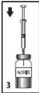
Figure 3 Insert the syringe needle through the stopper of the vial of lyophilized ActHIB vaccine component and inject the liquid into the vial.