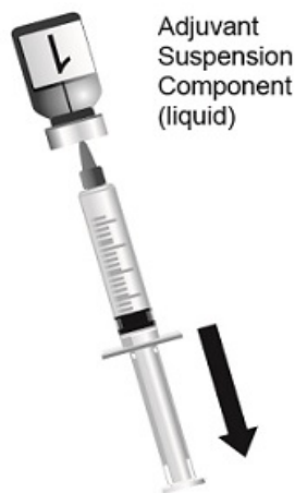
Figure 1. Cleanse both vial stoppers. Using a sterile needle and sterile syringe, withdraw the entire contents of the vial containing the adjuvant suspension component (liquid) by slightly tilting the vial. Vial 1 of 2.

SHINGRIX is supplied in 2 vials that must be combined prior to administration. Prepare SHINGRIX by reconstituting the lyophilized varicella zoster virus glycoprotein E (gE) antigen component (powder) with the accompanying AS01 B adjuvant suspension component (liquid). Use only the supplied adjuvant suspension component (liquid) for reconstitution. The reconstituted vaccine should be an opalescent, colorless to pale brownish liquid. Parenteral drug products should be inspected visually for particulate matter and discoloration prior to administration, whenever solution and container permit. If either of these conditions exists, the vaccine should not be administered.