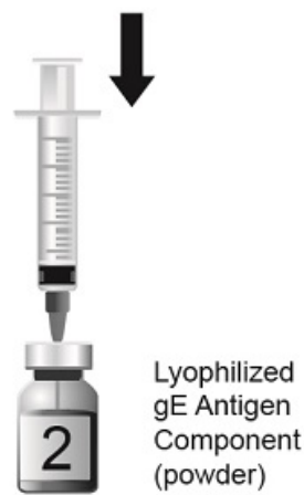
Figure 2. Slowly transfer entire contents of syringe into the lyophilized gE antigen component vial (powder). Vial 2 of 2.